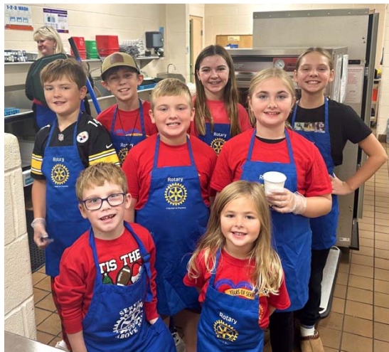
Meet our "Rotarians in Training!"

The Zelianople Club had a busy November. First, we toured the brand new Zelianople location for our local fire station. We held a pancake breakfast fundraiser to benefit the Hope Squad, a suicide prevention program at the Seneca Valley School District. We also: collected socks for the New Castle City Mission; ran a Lottery Calendar fundraiser; hosted a District Governor Official Visit Dinner for the Rotary Clubs of Ellwood City, New Castle and New Wilmington; and, hosted the annual Christmas Tree Lighting in conjunction with Small Business Saturday in Zelianople.