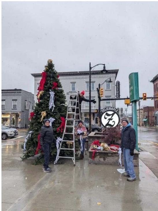
Zelienople Rotarians decorate the Main Street Christmas Tree. The Rotary helped donate the tree and take responsibility for setting it up each year.